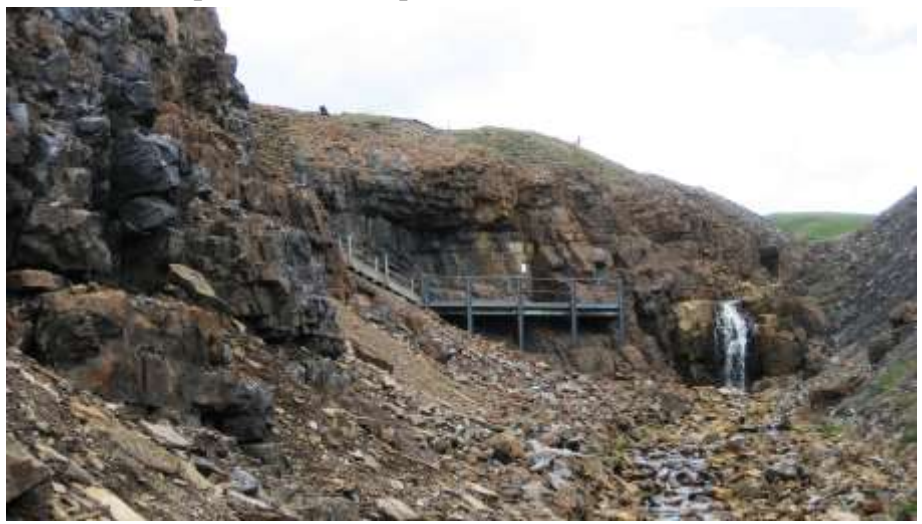
Figure 4. Mineralised Great Limestone in the banks of the River Nent. Although here completely replaced by ankerite, adjacent to Carr's Cross Vein, original bedding, jointing and other features are preserved in the altered rock. Weathering of the iron-rich ankerite gives the strong brown colour.

The village of Nenthead, at the head of the River Nent, a tributary of the River Tyne, owes its existence to the activities of the Orefield's other major mining company, the London Lead Company. It was this Quaker company who built the village as they came to recognise the great extent and value of the complex of lead deposits they had leased in this part of Alston Moor. Much of the village dates from the 1820s but, despite the long abandonment of the mines and the demolition of many original buildings, significant parts of the village remain substantially as originally conceived by this company. Notable buildings include the church, chapel, miners' reading room (now the village community shop), the Miners' Arms public house and rows of cottages. Several major mines were sited within or in the immediate vicinity of the village and many of the associated buildings, together with the remnants of the Lead Company's smelt mill are still prominent features.