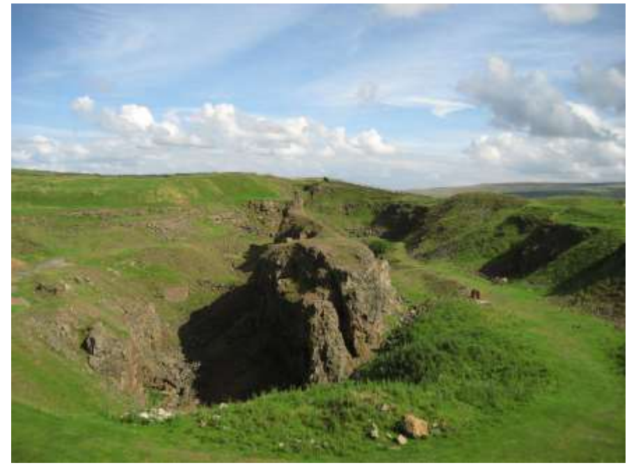
Figure 1. West Rigg Opencut. The quarry marks the extent of the 'limonitic' iron ore which was extracted from replacement 'flat' deposits in the Great Limestone adjacent to Slitt Vein. The vein itself, here composed mainly of quartz and a little fluorite, stands as an unworked pillar in the centre of the quarry. Narrow old lead stopes can be seen in the centre of the vein.

This site provides one of the finest and most instructive surface exposures of mineralised ground within the orefield and is designated as a Site of Special Scientific Interest (SSSI). Its main features of interest are interpreted in a board erected at the roadside by the North Pennines AONB.