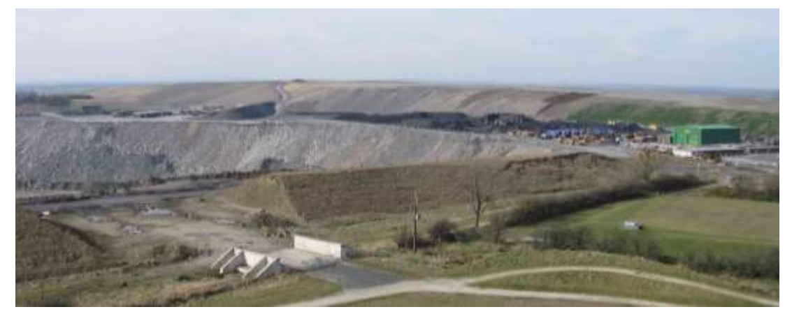
Figure 3. Coal storage area at Shotton Surface Mine, from Northumberlandia.

Coal Measures strata exposed in Delhi Surface Mine, Blagdon Estate, Northumberland (2005).