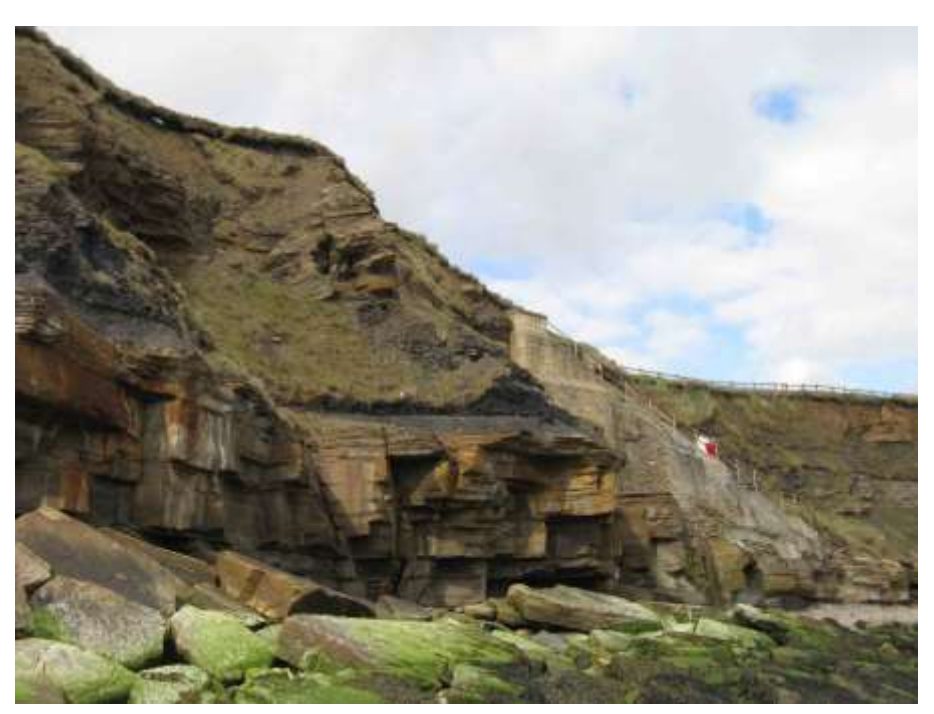
Figure 4. Hartley Steps, with the Low Main Seam half way up the cliff, overlying a thin seatearth.

Jones, J. M. (1967) Geology of the coast section from Tynemouth to Seaton Sluice. Transactions of the Natural History Society of Northumberland, Durham and Newcastle upon Tyne, 16, 153-192. Available from <u>www.nhsn.ncl.ac.uk</u>.